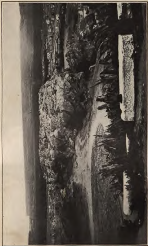
MARS HILL — ATHENS